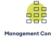
Management Consulting for Airlines

We have audited, re-structured and re-organized numerous airlines and MRO's, helping them create substantial long-term cost savings. Whether through an interim management solution or full-scale consulting project, we can provide a broad range of solutions by combining financial and technical driven know-how.