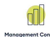
Management Consulting for MRO's