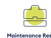
Maintenance Reserve Management