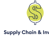
Supply Chain & Inventory Solutions

Over time, each airline operation generates a surplus inventory and requires material and components. Fleet changes, modification programs, and reduced usage rates are the primary factors influencing such inventory and components requirements. Excess parts gather dust on the shelves, generate handling costs and are non-working capital, while at aircraft maintenance induction, components requirements need to be addressed in time. Our team has been handling surplus inventories and components management for many years. With our structured approach, we ensure that dust-gathering assets turn quickly into cash and your aircraft receives everything it needs to get back to service.