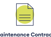
Maintenance Contract Review & Management