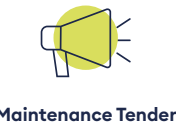
Maintenance Tender Management

Our consultants bring a very strong background in the fields of MRO, Supply Chain and Inventory Management. With our combined know-how, we are able to provide sophisticated solutions all around commercial maintenance.