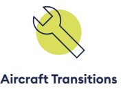
Aircraft Transitions and Inspections

We provide expert resources to handle all aspects of aircraft technical asset management. From Airworthiness Reviews to Aircraft Transitions to Return Condition & Compensation Management – as a CAMO+ we got you covered beyond the transaction and can provide real cost savings by hidden within your aircraft.