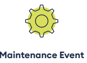
Maintenance Event Management